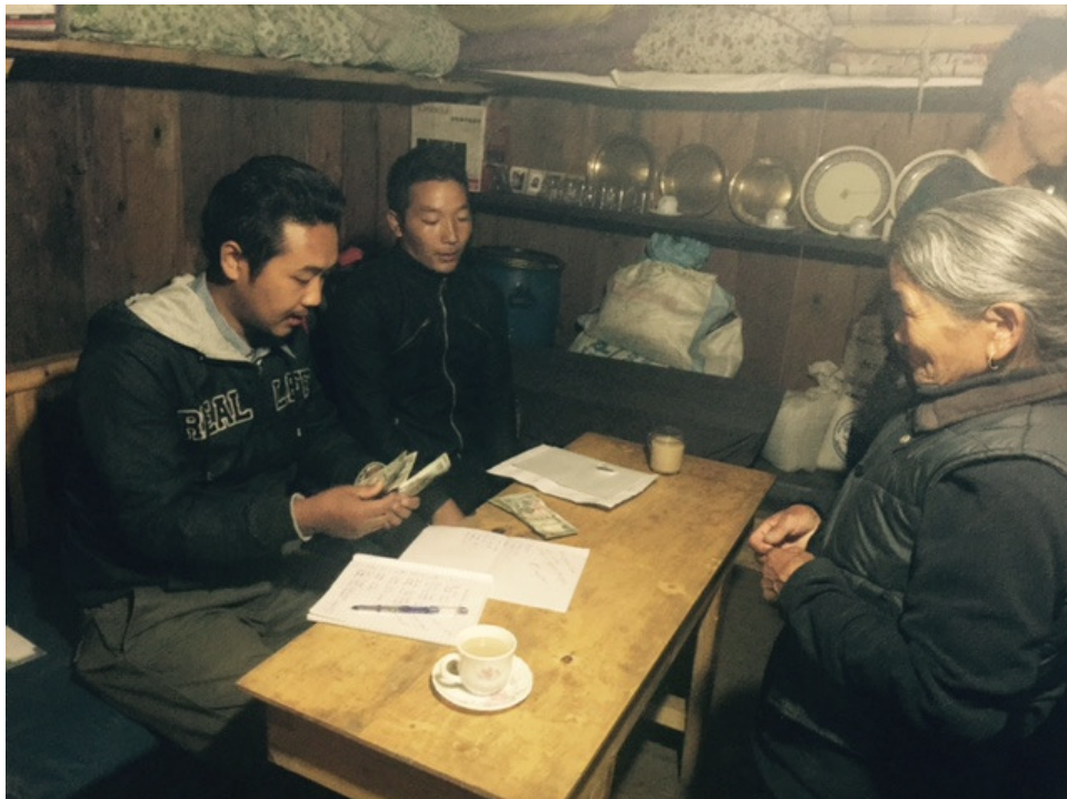
Pemba distributing funds to the children's families